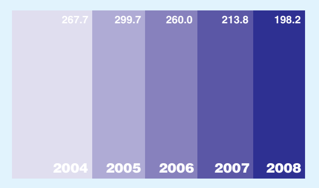
Revenue (RM Million)