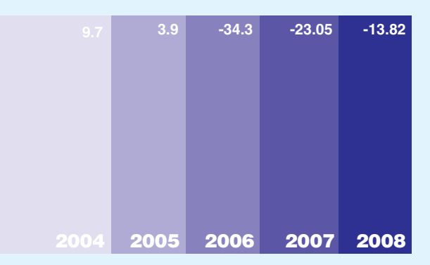
Earning (Loss) Per Share (RM Million)